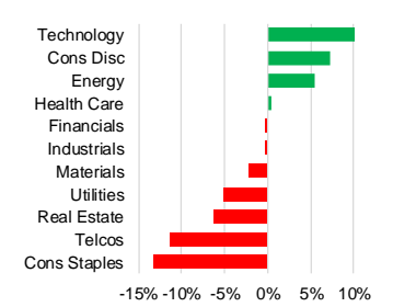
TSX Sector Performance YTD