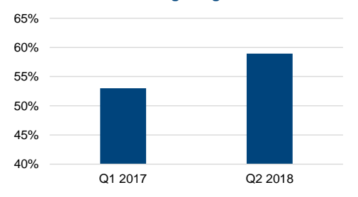
% of companies with sales rising >5% & falling margins